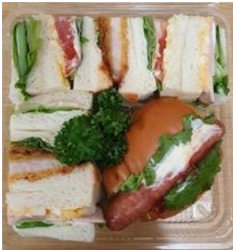
Sandwich Lunch Box: 700 yen Allergen: Wheat, Milk, Egg, Pork, Soybean