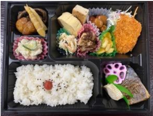
Zaigo-Bento (Hida/Furukawa local cuisine): 1500 yen Allergen: Wheat, Egg, Milk, Sesame, Mackerel, Soybean, Pork