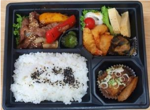
Hida-Gyu Bento (Grilled Hida-beef) 1500 yen Allergen: Information not provided.